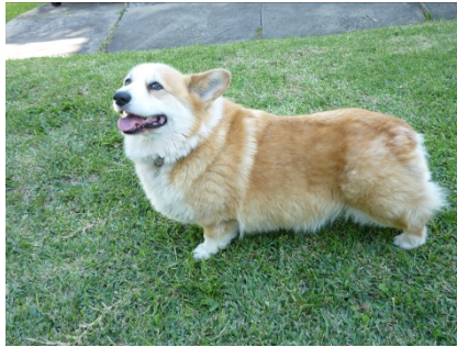
PUMBAA, READY FOR GENERAL DOGGINESS

BLOG WITH ANNUAL LETTER THINGY CAN BE FOUND AT: HTTP://OZBRIAN.BLOGSPOT.COM