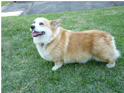
PUMBAA, READY FOR GENERAL DOGGINESS

BLOG WITH ANNUAL LETTER THINGY CAN BE FOUND AT: HTTP://OZBRIAN.BLOGSPOT.COM